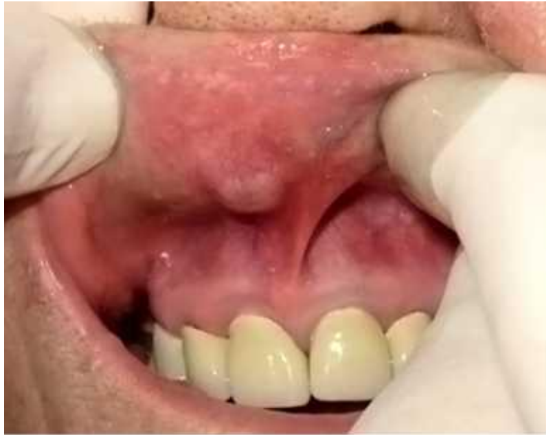
Fig. 1. Clinical aspect of the lesion by intraoral examination.

cell adenoma, Basal canalicular adenoma, the Warthin's tumor and oncocytoma were classified as monomorphic adenomas (MA) by the World Health Organization (WHO) in 1972. MA was considered a variant of pleomorphic adenoma, presenting few chondroid mvxomatous and components. 1991. Till no differentiation was made between BCA and canalicular adenoma; both beina classified pathologies as monomorphic adenoma.1 From 1992 till now, only six cases of BCA in upper lip have been described in the literature.<sup>2-6</sup>