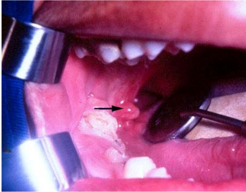
Fig. 1. Clinical aspects of the lesion, located in the palatoglossus arch (blue arrow).