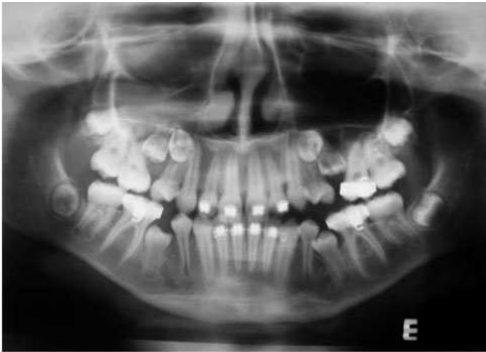
Fig. 2. Panoramic radiograph after removal of inferior second primary molars.

Figure 2 shows the patient at the age of 12. The inferior canines and first pre-molars were already at the occlusal plane and the second pre-molars in their normal path. At this age an occlusal radiograph of maxilla was made ( figure 3 ). The upper second pre-molars were in palatal position in relation to the first molars. So, it was accomplished the extraction of the upper second primary molars and upper second pre-molars as recommended by her orthodontist. After removal of the four ankylosed primary second molars and four second premolars the patient is under current orthodontic treatment.