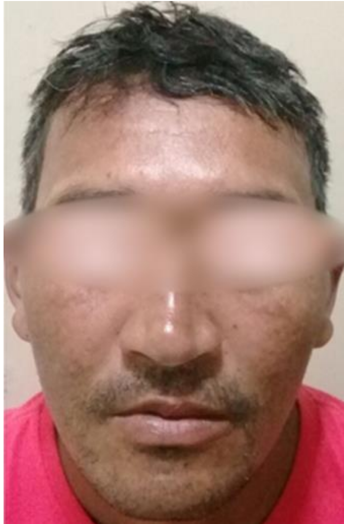
Fig. 3 - Seventh month of the postoperative period without aesthetic and functional complaints.

maintained occlusion and absence of paresthesia of the infra-orbitary nerves. The patient is in the seventh month of the postoperative period without aesthetic and functional complaints (Fig. 3).