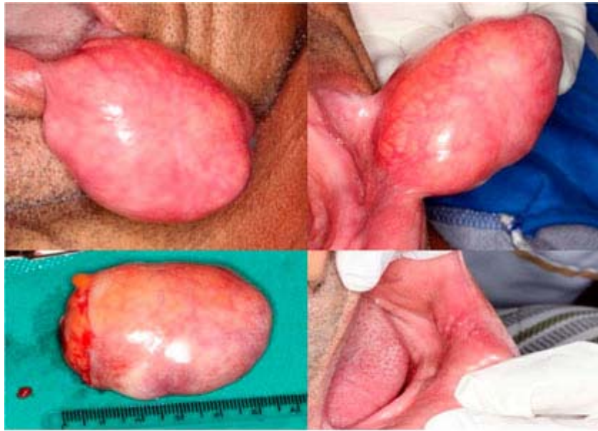
Fig. 1. Upper left/right: nodule arising from mucosa of lower lip with flat consistence and pedunculated insertion. Lower left: macroscopic view of the specimen. Lower right: clinical appearance after surgical removal.

An excisional biopsy of the lesion was performed from a simple surgical excision and the chirurgic piece was placed in 10 % formalin, where a floatation was noticed. It was sent for histopathological analysis. In the microscopic examination, fat cells arranged in lobules and separated by thin bands of connective tissue were observed (Fig. 2). Thus, the diagnosis of lipoma was confirmed. The patient is under a follow-up for 2 years, showing no recurrence.